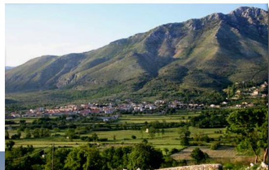
S. Pietro Infine Basin