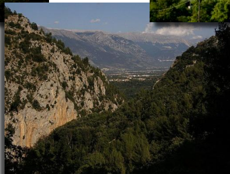
S. Venanzio gorges and Sulmona Basin